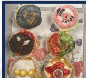
Yr 8: Rabia & Maheen